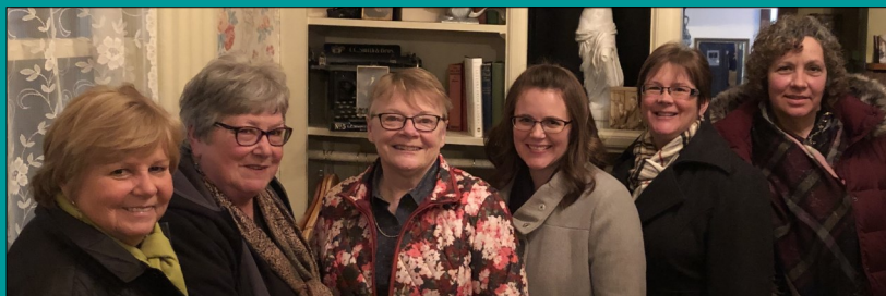
2018 Library Staff