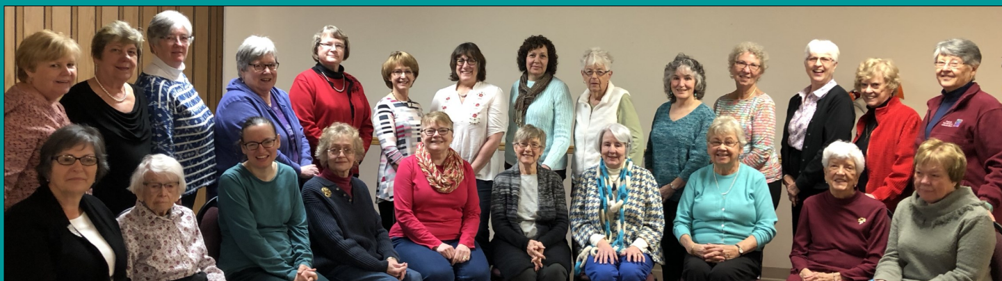
2018 Volunteer Luncheon, presented by the Library Board, with Volunteers and Library Staff.