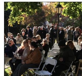
Family and Friends