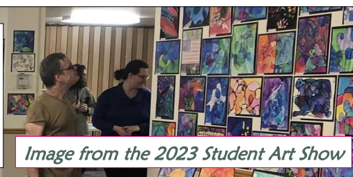
Image from the 2023 Student Art Show

Monday, May 20, 2024 5:30-7 pm — Lower Level